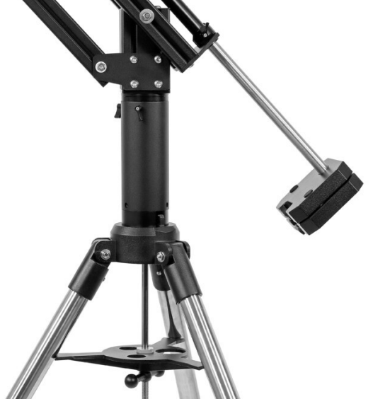
Product no. 60250: a stable camera tripod with a load capacity > 25kg is required