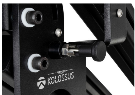
Opened transportation lock

It is best to grip the mount by the (still) stowed counterweight bar when lifting it out of the carrying bag. You can put the L-bracket and, if necessary, the counterweights aside for now.