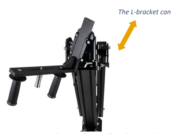
be moved vertically in the prism clamp

If you have not yet attached the weights to the counterweight bar, you can do that now and ensure that they are secure. The counterweight bar can be extended by a hand span (approx. 20cm). It is best to place the counterweights at the very end of the bar first, because you can roughly balance them by extending the bar.